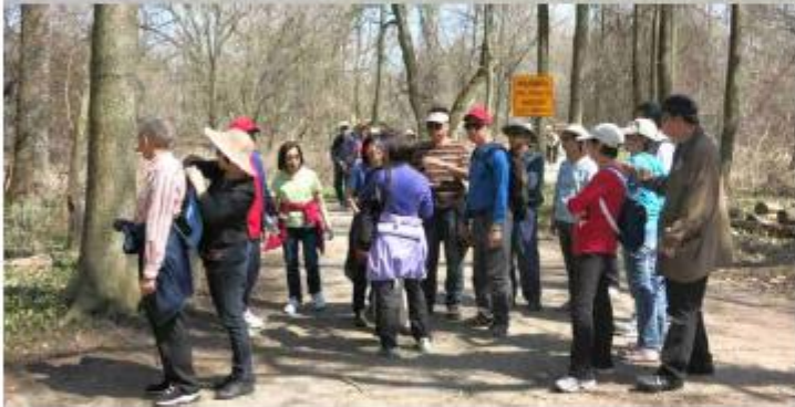
Bus tour to Finger Lake USA, Watkins Glen State Park & Boat trip on the tranquil Finger Lake with fun !