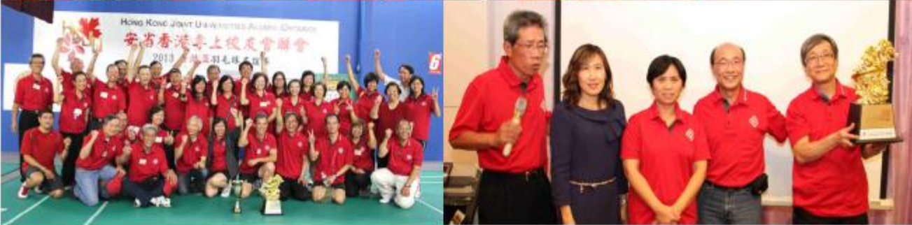
First Runner up 2013 Hong Kong Cup Table Tennis together with four Social Work PolyU trainees from Hong Kong to cheer !