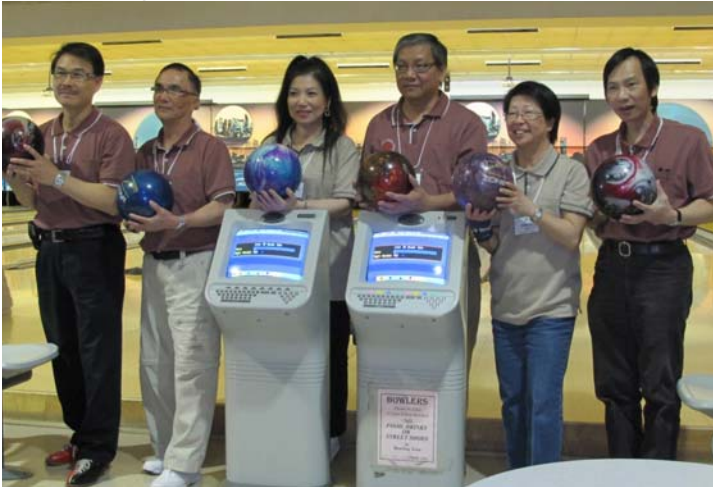
Our Bowling Team Members