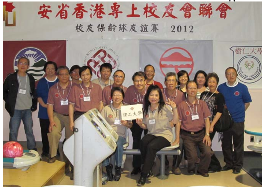
Our team and supporters